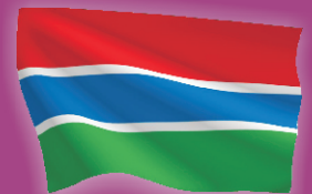
Banjul, The Gambia