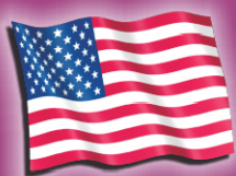
Rockville, Maryland (United States of America)