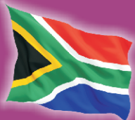
Johannesburg (South Africa)