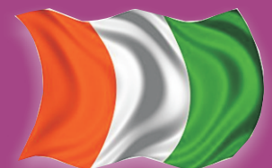
Abidjan, (Cote D'Ivoire)

The Management School London, United Kingdom